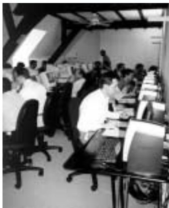
The computer room during our speculative attack game