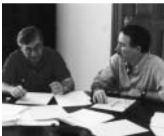
Elhanan Helpman and Gene Grossman

The month of July at Gerzensee is often considered a summer camp for economists. Even though the Study Center still hosts external customers, its main activity is hosting the European Summer Symposia in Economic Theory and in Financial Markets. During four weeks, some of the most reputed economists interact with a large number of promising younger, mostly European, economists. For example, Nobel Prize winner Sir James Mirrlees stayed for two weeks at Gerzensee and was one of the 150 economists who attended these meetings. The full programs and the lists of participants are available on our homepage at www.szgerzensee.ch/conferences .